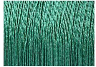
02 PRACTICALLY ZERO EXTENSIBILITY AND ULTRA-SENSITIVITY