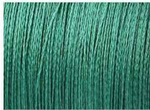
02 PRACTICALLY ZERO EXTENSIBILITY AND ULTRA-SENSITIVITY