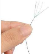
03 4 STRANDS PE LINE, SUPERIOR ABRASION RESISTANCE