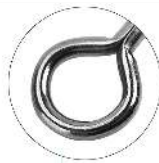
Stainless Steel Welding Ring Not easily deformed